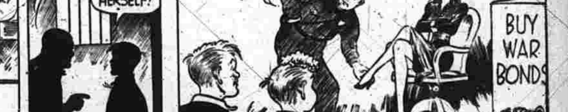
A Bit Far-Fetched BY MERRILL BLOSSER