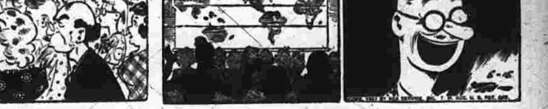
Very Simple BY EDGAR MARTIN