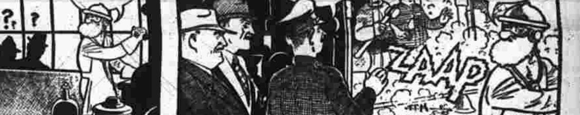
Too Late BY V. T. HAMLIN