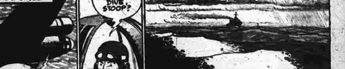
Guess Again BY ROY CRANE