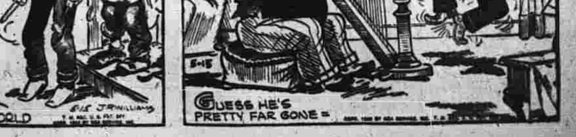
MAJOR HOOPLE BY J. R. WILLIAMS